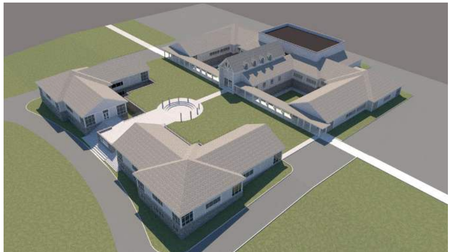
Concept rendering of future phases